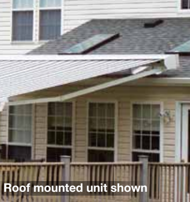
Roof mounted unit shown