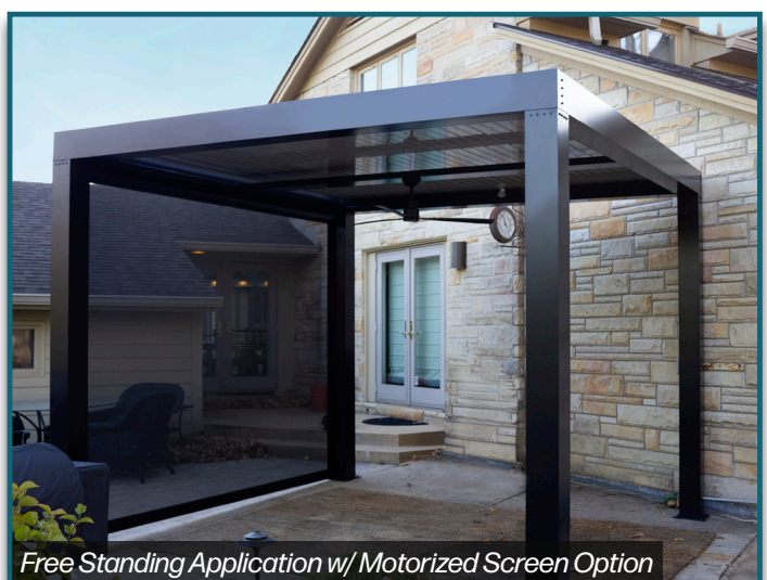
Free Standing Application w/ Motorized Screen Option