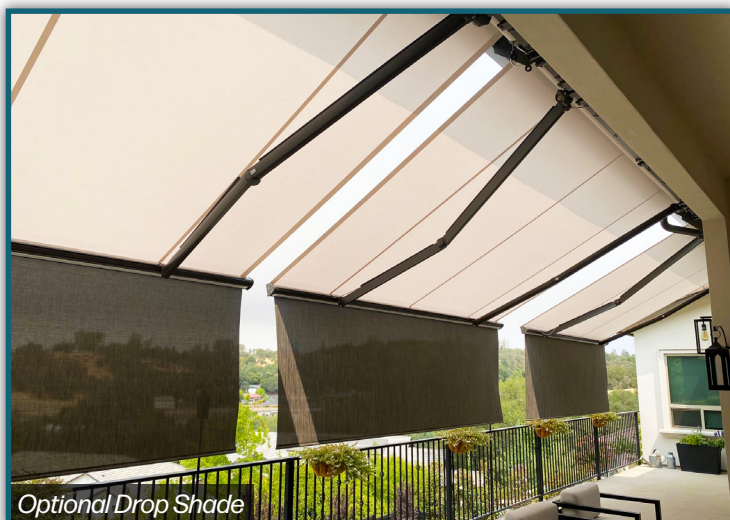
Optional Drop Shade

The Eclipse Premier is the upgraded “Gold Standard” of our Eclipse model and is known to be our most popular unit. The Eclipse Premier offers the latest key product enhancements to ensure a long lasting, trouble free shading system. This unit is confidently backed with our extended Platinum Protection Warranty package included at no additional cost. The Semi Cassette option features components that provide a refined, finished look while adding strength and durability to the system. The aluminum powder coated torsion bar has been upgraded to a stronger, thicker wall profile to increase unit rigidity. The retractable arms are where you'll notice the greatest improvements. These arms feature larger profiles, a concealed heavy duty arm belt, sealed ball bearings at the elbow, and an overall feel of a contoured designer look.