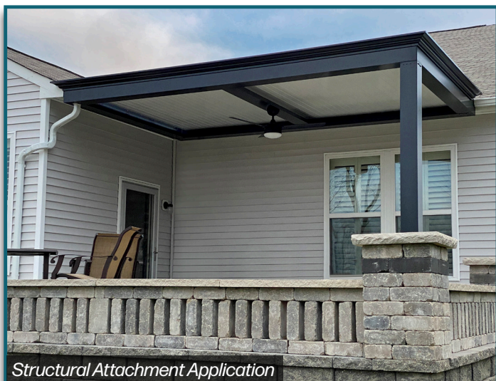
Structural Attachment Application