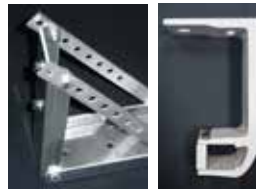
ROOF MOUNT SOFFIT MOUNT

The Eclipse features a non corrosive torsion bar that is powder coated to match the framework of the awning.