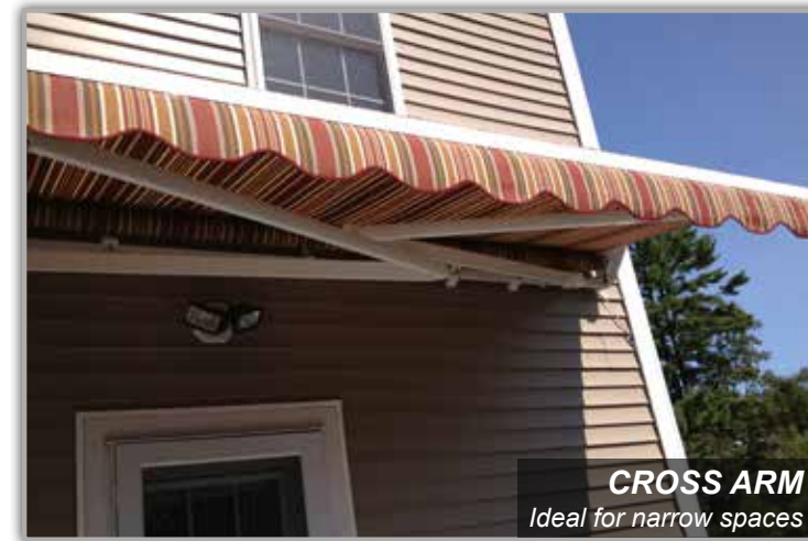
CROSS ARM Ideal for narrow spaces